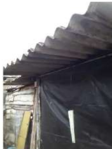
PIYASEELI SILVA D - MORATUWA Funds given to replace damaged three roofing sheets Rs 6,000