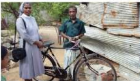
RAJAH N. - AMPARA New Bicycle Rs 15,000