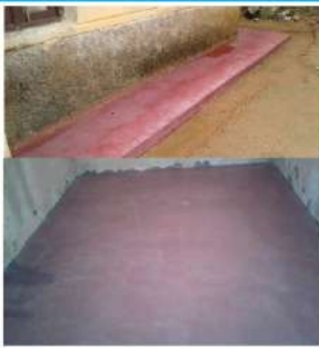
JAYASINGHE W M N K - KANDY Cementing of the floor Rs 64,800

The Rotary Club of Colombo who has funded SUROL projects amounting to Rs. 200,200 last year also, through the facilitation of Rotarian Tony Alles . These funds helped six beneficiaries as follows: