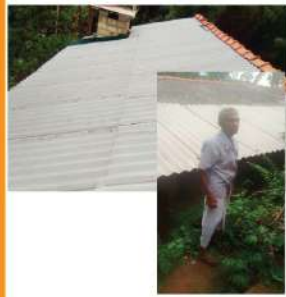
WIJESINGHE H M - KANDY Repairs to roof Rs 50,000